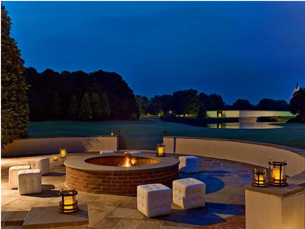
Guest House Patio

Guests of the Milliken Guest House and Milliken associates are encouraged to share the beauty and elegance of this one-of-a kind facility through photography. For personal privacy, we ask that any images including other guests or associates have permission from those individuals.